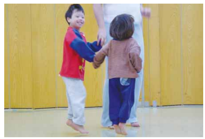
A creative dance program can help children with Down syndrome improve the form and quality of their movement patterns.

Boswell (1993) also found that dance improved the balance skills of children with mild intellectual disability more than a traditional gross-motor program. Specifically for children with DS, Jobling (1993) advocated the use of