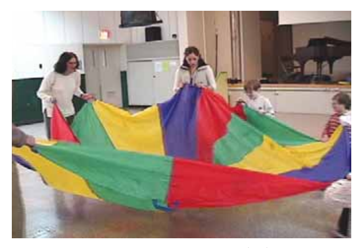
Negotiating an obstacle course of cartons (left) can help develop spatial awareness, while pulling a parachute up (above) and letting it fall back down can improve effort awareness.

struggling on a fisherman's hook." (Borten, 1963, n.p.)